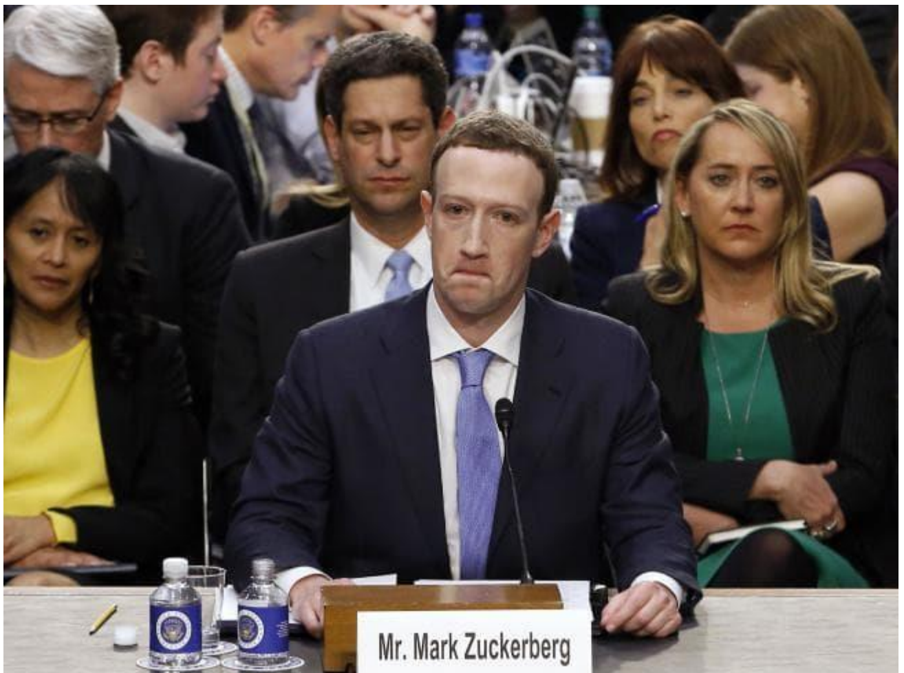
Facebook CEO Mark Zuckerberg was worn down by the proceedings.

But as Wednesday's hearing, in which he made another shock revelation about possible breaches of privacy , came to a close the world's sixth richest man began to crack, successfully worn down by a time-old tactic.